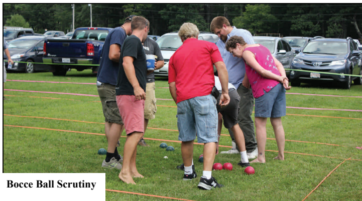
Bocce Ball Scrutiny