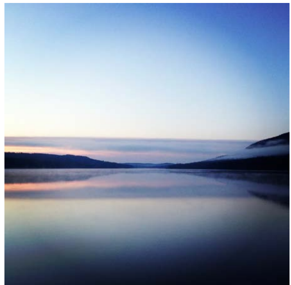
A view of Moose Pond on the way to the Bi-monthly Meeting on December 13 th in Fryeburg.

Thank God, I dodged the bullet, it would have looked really bad for me if the Mayan’s had been right!